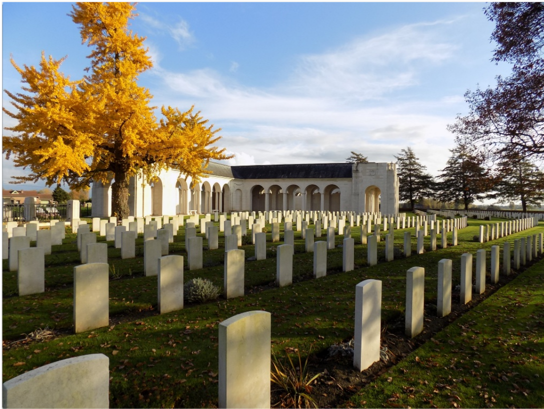
Le Touret Memorial