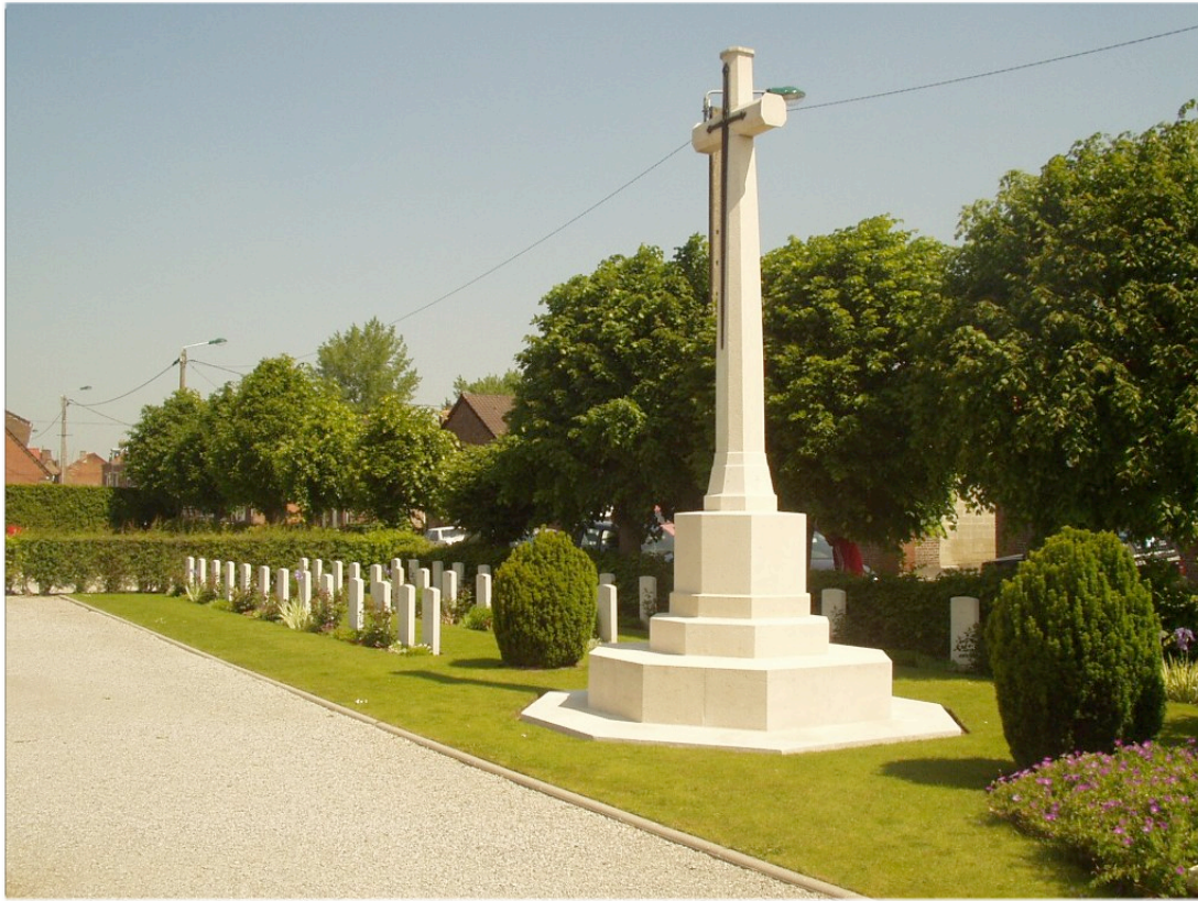
La Gorgue Communal Cemetery